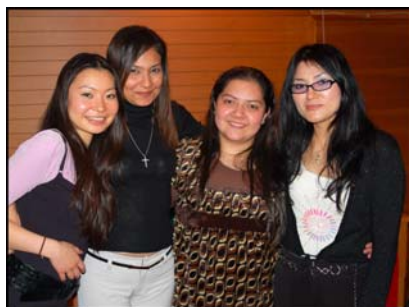
Four beauties from our Fellowship