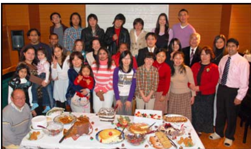
Over 30 people joined our dinner

It was an exhausting effort, but we were truly humbled to have this chance to reach out to so many new friends.