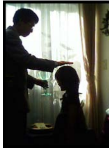
A sacred moment